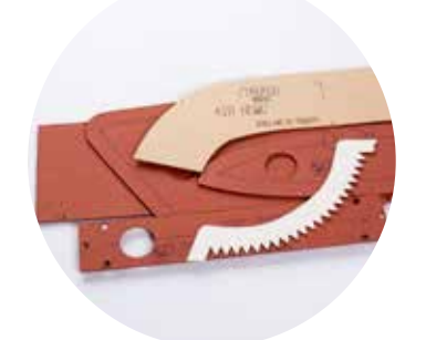
Leather, Fabric and Foam